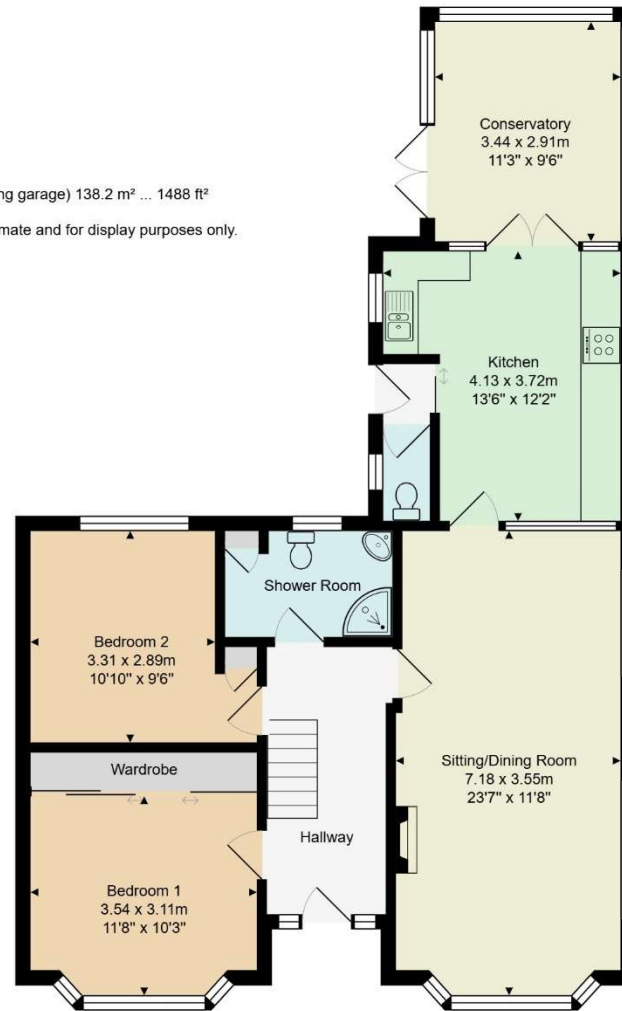
Ground Floor Area: approx 90.2 m 2 ... 971 ft 2